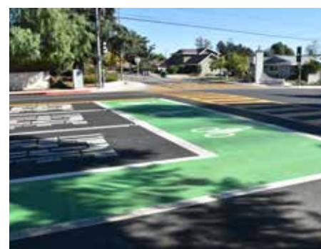
Green Bike Box – Intersections