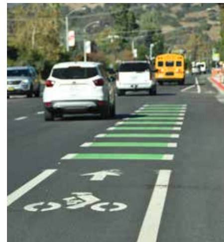
Dashed green areas

When driving on any street in the city, please slow down and be aware of pedestrians and cyclists sharing the road. Cars, cyclists, and pedestrians must all follow the rules of the road. Stay alert, slow down, and be safe.