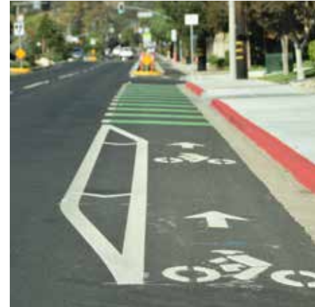
Buffered Bike Lane