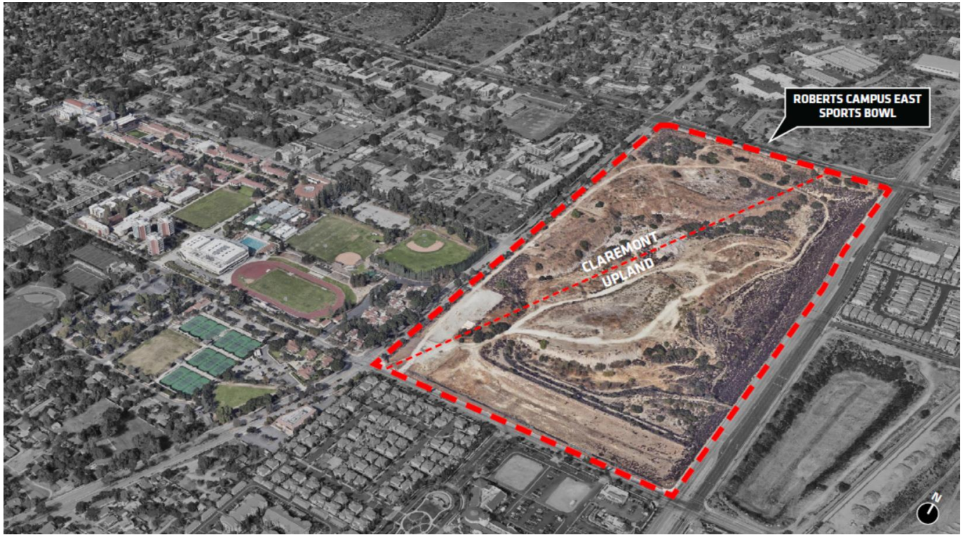
Aerial View of East Campus Site